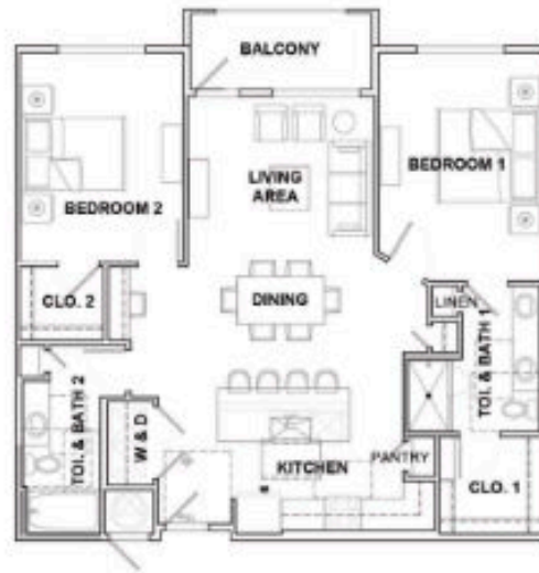
2-BEDROOM UNIT B3