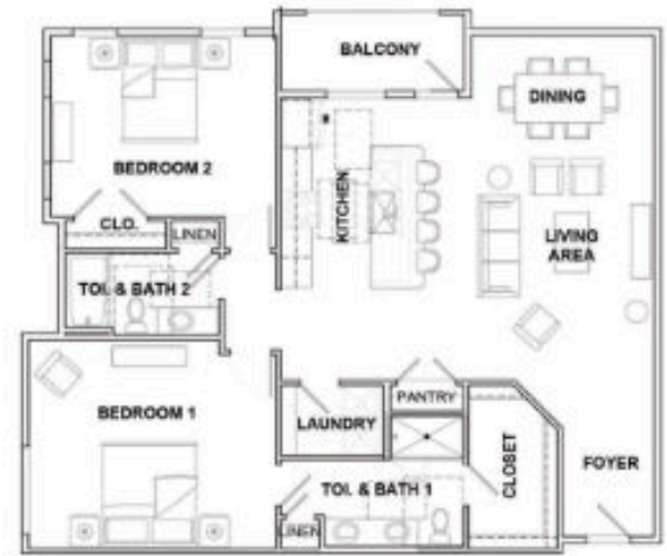
2-BEDROOM UNIT B4