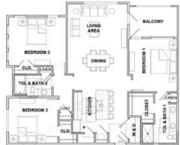
3-BEDROOM UNIT C1

All information contained herein is believed to be reliable. All information is subject to error, omissions, and prior withdrawal without notice.