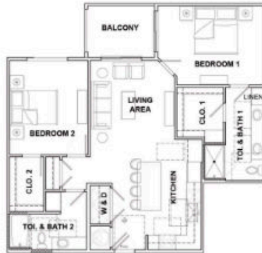
2-BEDROOM UNIT B2